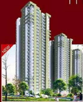
Eldeco Magnolia Park, Sector 119, Noida