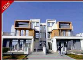
Eldeco Greens, Nakodar Road, Jalandhar