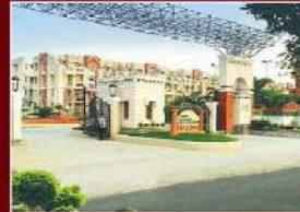
Eldeco Green Meadows, Greater Noida