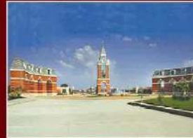
Eldeco Estate One, G.T. Road, Panipat