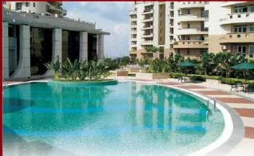
Representative images of proposed facilities at Eldeco Estate One.

Disclaimer: • The area and plan shown here are subject to change. • 1 sq. ft. = 0.093 sq. mt. 10.764 sq. ft. = 1.196 sq. yd. and 3.28 ft = 1 mt. • All dimensions shown in feet inches are close approximation to metric dimensions. • The above plan is indicative. Please check actual plan with marketing.