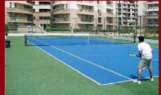
Actual photographs of Eldeco Utopia Club, Noida, already operational