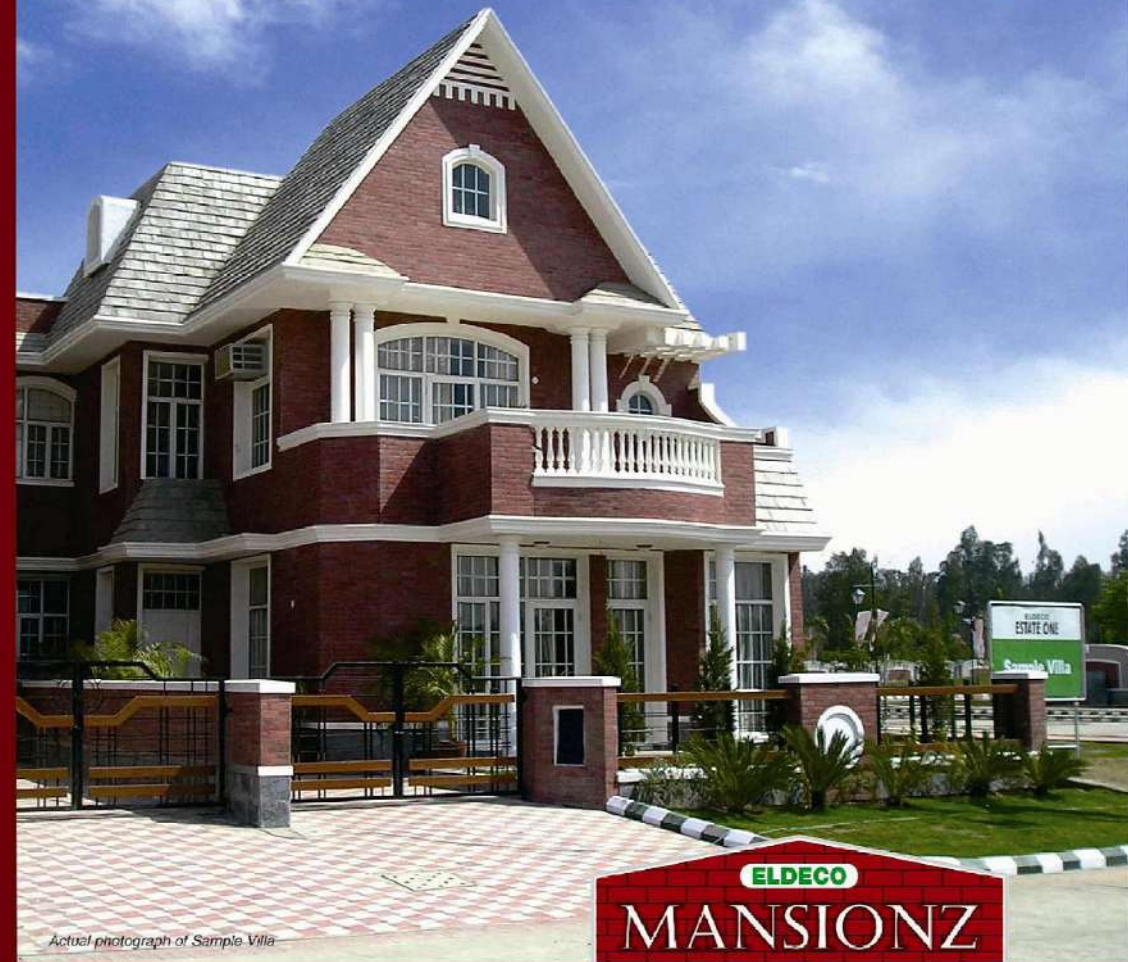
Actual photograph of Sample Villa