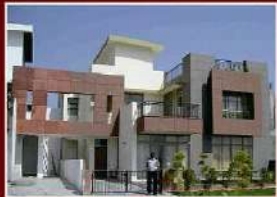
Eldeco County, Sector 19, Sonapat