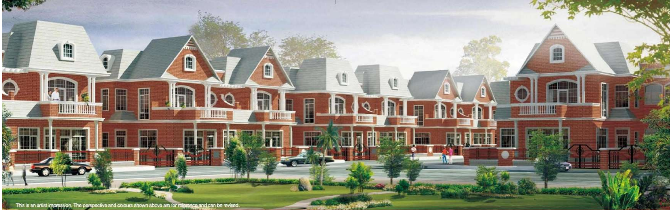
This is an artist impression. The perspective and colours shown above are for reference and can be revised.