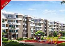
Eldeco Mystic Greens, Sector Omicron, Greater Noida